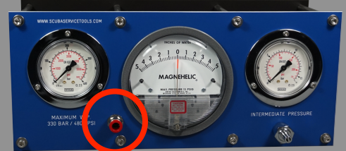
Standard test bench

The other end of the red rubber hose is connected to the regulator by sliding the black rubber part over the mouthpiece of the second stage regulator (before connecting make sure the original mouth piece from the regulator is removed).