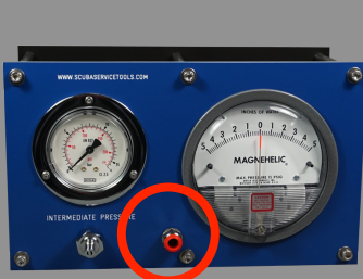
Resort test bench

First, we connect the black plastic stint on the end of the red rubber hose into the test bench adapter for the Differential pressure gauge by pushing it in. (The black part can be removed after testing by pushing the red ring on the connector).