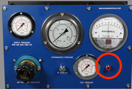
Professional test bench